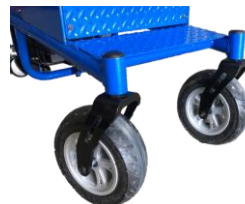
Swivel front wheels