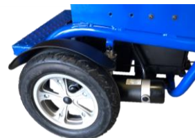
Dual drive wheels